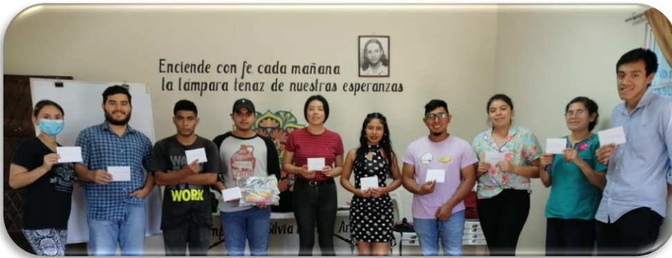
2023 Scholarship Recipients

Sombrilla has continued the ongoing commitment to the Jose Garcia Scholarship project for post-secondary. Sombrilla provides support to 4 of 12 recipients. We believe that providing individuals with the Right to Education at any stage of life fosters tolerance in society and contributes to reducing conflicts among diverse populations.