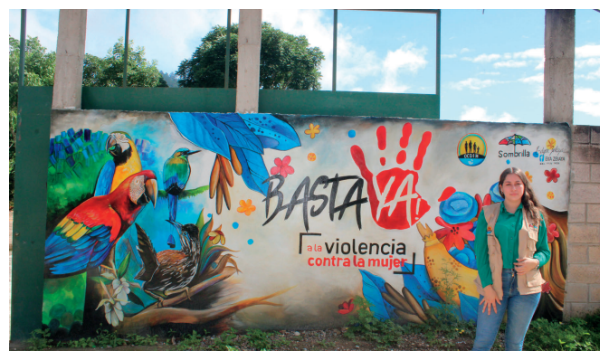
Karla Marquez, Mobile Clinic Lawyer

The project accomplished its goal to raise awareness and knowledge of gender-based violence and increased access to the judicial system to protect their rights, in particular, the right to a life free of violence. The creation of self-help groups established in the communities empowered women to defend