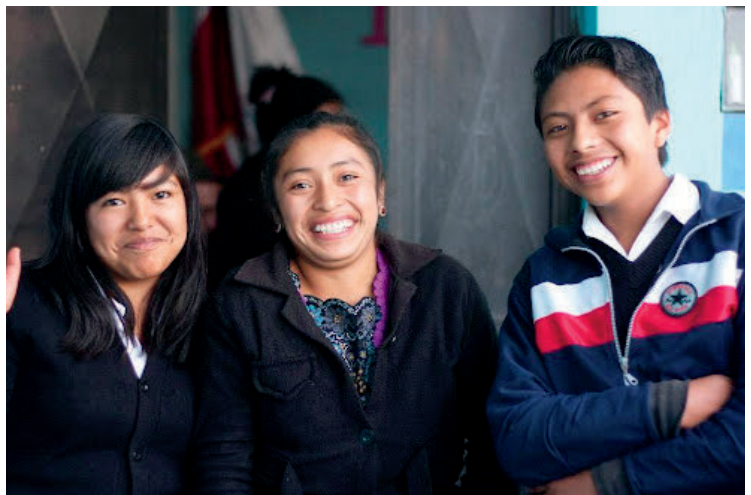
Students at the Tierra Colorada School

The most recent communication indicated they have 26 students in primary grades, 32 in secondary school and 22 in junior high for a total of 79 students. Classes have resumed in person and proceed daily.