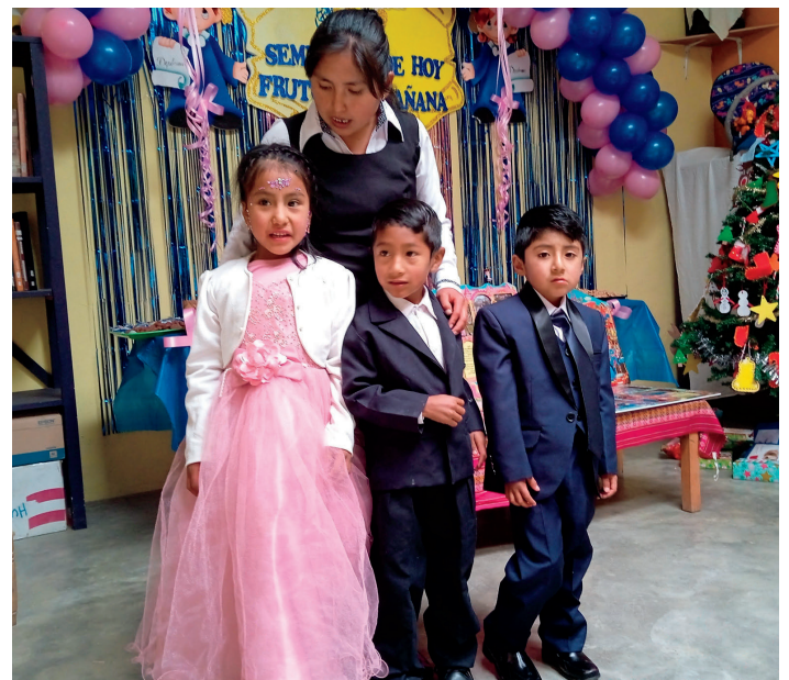
Children graduating this year entering primary school

Some good news is that the preschool has fully opened with the children attending classes in person. Three children graduated this year and will be entering primary school.