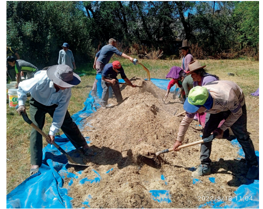
Food security project

The food security project added two more family greenhouses bringing the number of families in the community with greenhouses from the project to 56. Two workshop were held to build horticultural capacity for the families that have greenhouses.