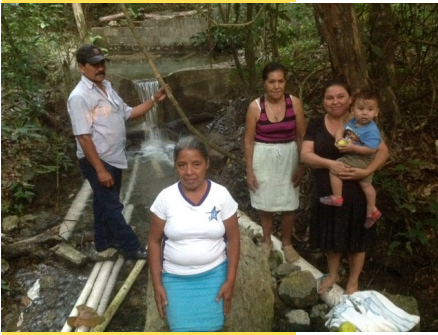
Water source for the plantation of passion fruit for the Women's Co-op in Honduras

Over the past year Sombrilla continued to support marginalized communities in Latin America through close collaboration with our partner organizations on the ground. As part of this work, we were able to successfully complete a number of