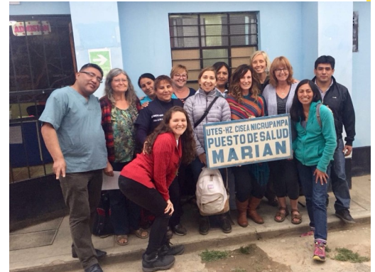
The team outside the Rural Health Post of Marian

local supporters in many different ways. With your continued support in the future we hope strengthen our efforts to provide opportunities for communities in Latin America.