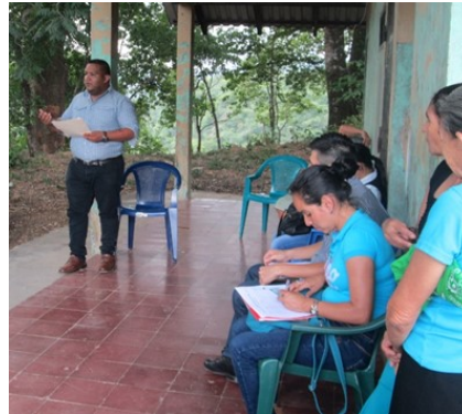
Scholarship recipient after completion of his law degree supporting the local community

Upon completion of their degree, students often stay involved with the program and share their time and skills with their hometowns.