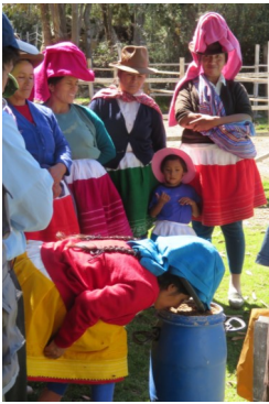
Women in Yurac Yacu participating in an organic gardening workshop

This year Sombrilla expanded its successful partnership with Andean Alliance in Yurac Yacu, Peru to improve access to a healthy and sustainable food