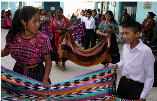
Students at the school in Tierra Colorada, Guatemala

Sombrilla also continued to work in partnership with community organizations on the following projects: