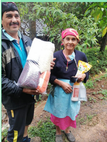
Food distribution in El Salvador

This year the school has been closed due to COVID 19 and the community has been under quarantine. The teachers have continued to teach remotely and the majority of students have continued to study