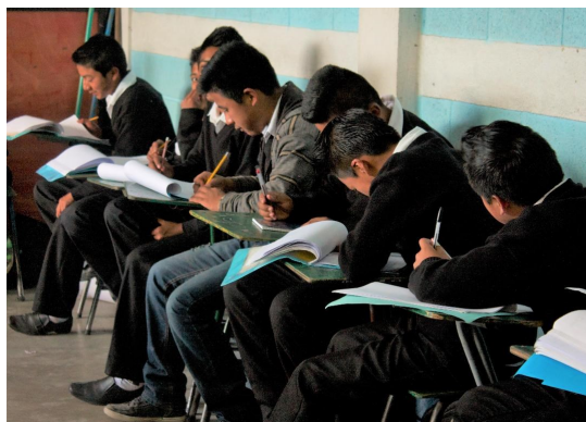
Students from Tierra Colorada

We also started a Garden project in TC in June 2021. The goal was to teach students to grow common vegetable crops, include families and community in the project and attain a measure of food sustainability.