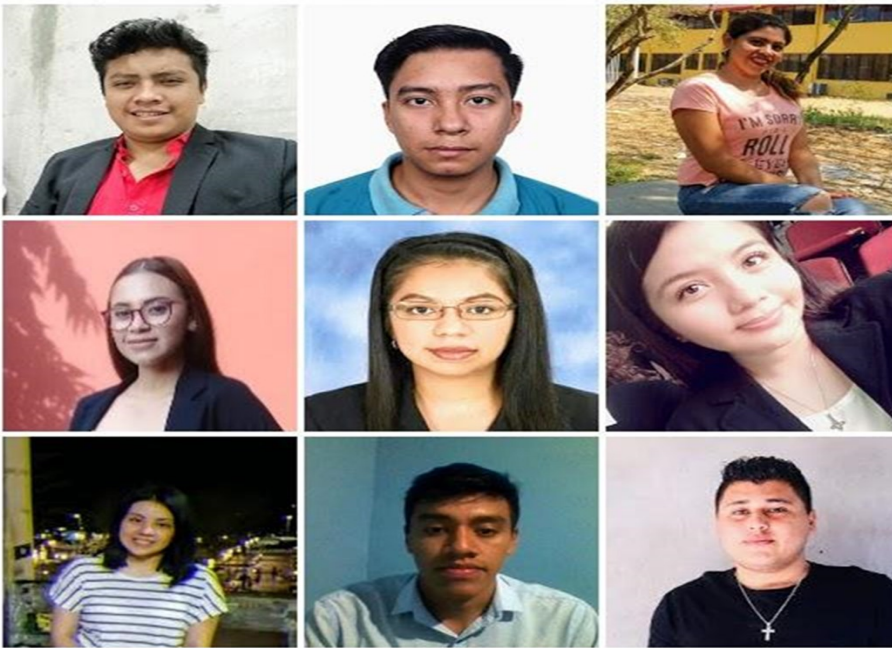
Students from El Salvador