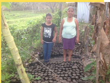
Women's Agricultural Project

The overall goal of the project is to empower women through integration into agricultural value chains. Based on the project proposal, women wanted to produce seedlings in a greenhouse and sell the plants to other CAEOL members of the cooperative. Due to changes in the market and corresponding change in production