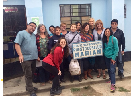
The Urogynecology team in Marian, Peru

With your continued support in the future we hope strengthen our efforts to provide opportunities for communities in Latin America.