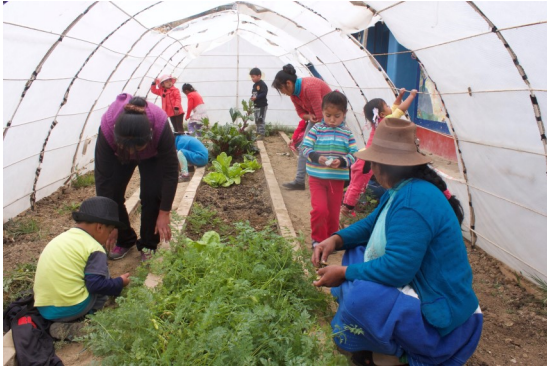
Preschoolers in their greenhouse at the Yurac Yacu Community Centre

gram in Yurac Yacu with a focus to improve food security and generate income.