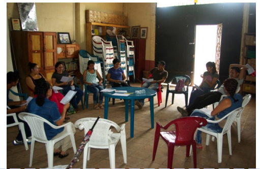
Meeting of Scholarship Students, Casa CEBES

student is asked to form a youth group of 5 or 6 members that will meet twice a month to reflect on the issues affecting young people today.