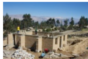
The walls go up on the first room of the community centre

Funds for this part of the project were raised by Andean Alliance and the community residents are donating time and resources on a sweat equity basis. We were lucky enough to be in the community as this building went up this summer and to be able to spend a day working with community members on the construction. This room will be complete and in use for the children's classes by the end of this month.