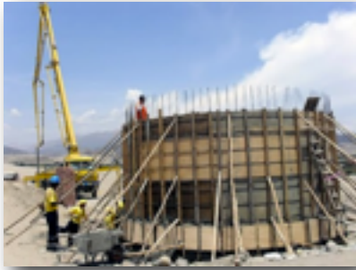
Construction of the water treatment facility

For five years now Sombrilla has been working with the people of Huayllacocho Peru and partner organization Centro de Medicina Andina to bring clean water to the community. Huayllacocho is a high Andean village about a 2 hour journey away from Cusco. The water supply in the village was dwindling and the water was untreated leading to gastrointestinal illnesses. Originally we had planned to bring water to the community from springs above the village, but that plan had to be reworked as the springs started to dry up. The regional government, under pressure from the community to help, put in a basic water and sewage system. The new system still did not provide water to all residents and often left the village with no water at all. A new project plan was put in place and the water was to be brought from a lake in association with a Peruvian government megaproject, Megaproyecto Sambor Haypo. We then had to wait for the government to build the dam needed to supply the water. This project was held up for about a year due to massive flooding in the region. Finally this spring the dam was completed and work started on the Sombrilla project. A pipeline was constructed bringing water from the lake to the community. A water storage and treatment facility was built and a closed water system bringing the water into homes was put in place.