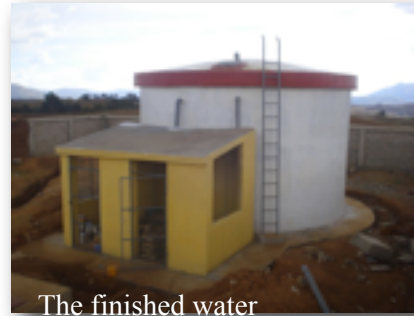
The finished water treatment facility

Training was given to community members who will,