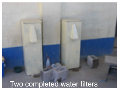
Two completed water filters