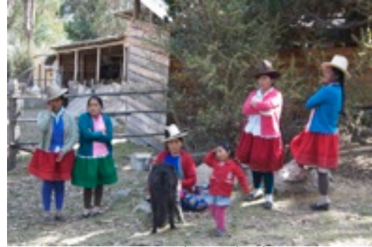
Women at a community gathering

Sombrilla Refugee Support Society, in partnership with Peruvian NGO Andean Alliance, is planning to complete construction of the Yurac Yacu Community Centre and to fund educational projects in the community. When you contribute monthly through the Adopt a Community fund you will be