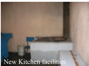
New Kitchen facilities

A new computer/laptop storage unit was constructed by a local welder and windows with bars have been installed in two classrooms to provide additional security for the laptop computers and other attractive items. The nearby medical/health center, motivated by our charitable efforts, has contributed time & materials to improve the kitchen/cooking facilities at the school. Mothers in the community use these cooking facilities to provide a snack for all students three times per week