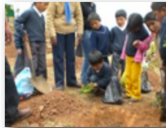
Planting in Huayllacocho

In an earlier stage of the project almost 10,000 indigenous plants were planted to help to conserve moisture within the village. A year later the plants are growing well and being cared for by school children, community groups and families.