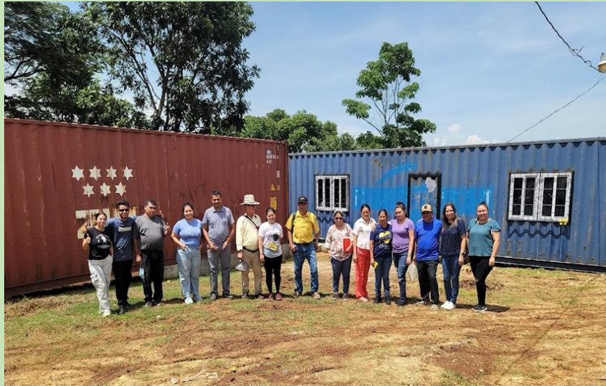
ACH board and staff outside the container that will house the new vocational training program. The red Seacan is the one that just arrived from Canada

On September 27th, a Seacan from Canada arrived in Honduras with a load of computers, sewing machines tools and other materials. Sombrilla's Computer Assisted Learning project is dependent upon having sufficient computers for the students to work on. Here in Canada we can receive donations of good used computers, then we need to get them to the project in Honduras. In late 2019 a computer collection initiative began and with its success came the idea of filling a Seacan with computers and other items which would be used to support education and vocational programs.